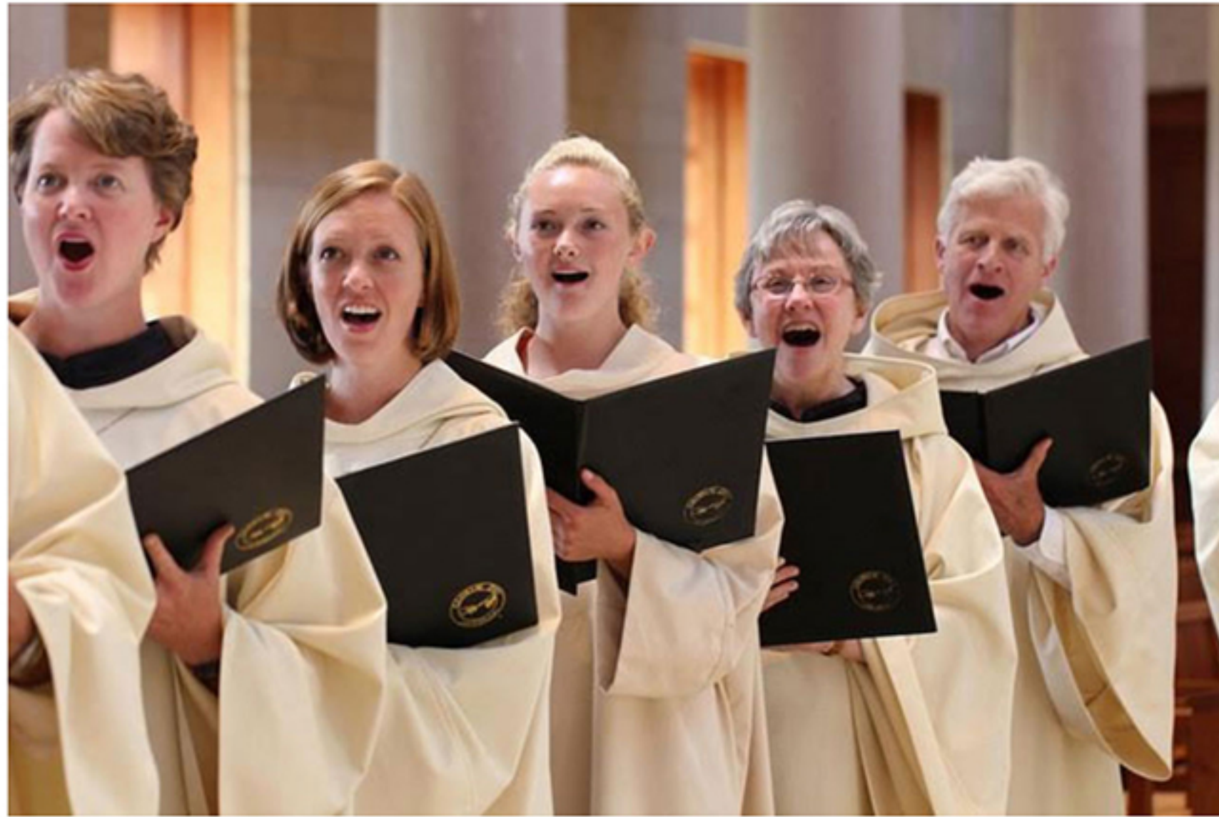
Gloriæ Dei Cantores.